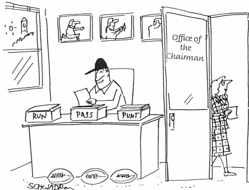
Another day in the life of a Committee Chairman