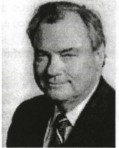
Sen. Gene Stipe