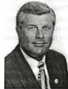
Sen. Dave Herbert

what different in the Senate, where Sen. Dave Herbert, D-Midwest City, voiced the most objection to the bill.