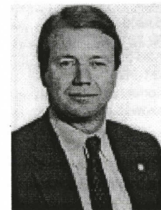
Rep. Randall Erwin

While a part of the legislative-executive budget agreement announced a little more than one week ago, passage of the bills, particularly in the House, followed some contentious debate.