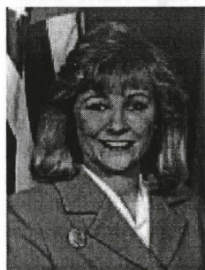
Lt. Gov. Mary Fallin