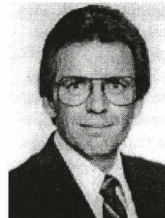
Rep. Dan Webb

■(GIT) An effort to protect the state's long-term care ombudsman program from federal budget cuts was sidetracked on Monday when a state lawmaker pressed for the addition of new language setting rules for abortion facilities.