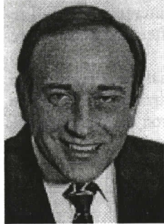
Sen. Cal Hobson

"I don't know what caused his 11th hour conversion, but it's certainly good news for our economic development efforts," said Sen. Cal Hobson, vice-chairman of the Senate Appropriations Committee.