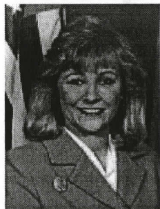
Lt. Gov. Mary Fallin