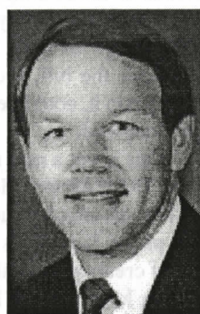
Sen. Don Nickles

"Those who created the institution of the Congress of the United State would have been shocked to learn that former members convicted of felonies continue to draw their taxpayer-financed pensions," Nickles said.