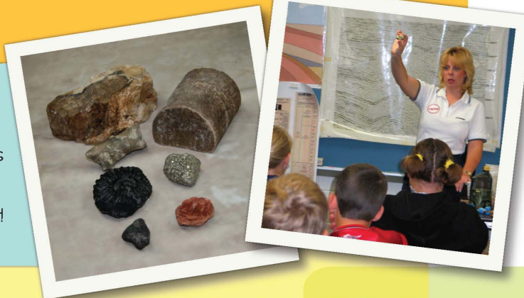
Rock samples included in Petro Pro kit

Feel free to add extra materials to your kit that are specific to your job. The students will love it!