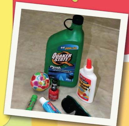
Petroleum By-Products included in kit

-Chuck Henkes, Weatherford Drilling Services