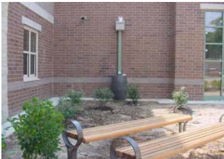
Rain barrel in use at a school

The Rouge River runs through several urban communities in the Detroit metropolitan area. The river has been the site for many industrial plants and operations over the last century, providing a beneficial resource but also succumbing to substantial environmental damage. Industrial and human waste was routinely flushed into the Rouge as urban population centers grew along the river in response to the industrial boom.