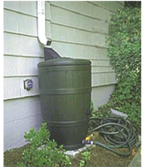
A typical rain barrel