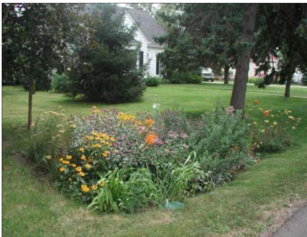
A typical rain garden

http://www.dnr.state.wi.us/org/water/wm/nps/rg/