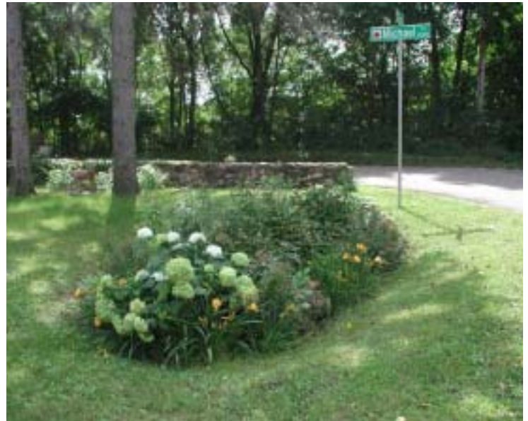
A shrub rain garden in Maplewood, Minnesota

A rain garden should be kept at least 10 feet downslope from a house, so that any overflow flows away from the structure. A rain garden should be a 2 to 6 inch deep dish shaped depression if standing water is not desired and approximately 18 inches if standing water is desired. A typically sized rain garden is approximately 70 square feet and in a shape or design that follows the drainage system of the landscape. All utilities should be marked before installing a rain garden to avoid digging up or over water mains and electrical lines. Rain gardens should