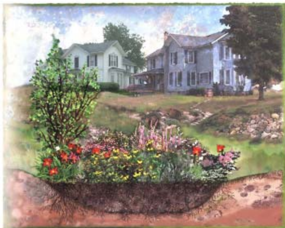
A typical rain garden below the soil (Painting by Ruth Zachary, permission to use by Rain Gardens of Western Michigan)

In 1996, the City of Maplewood partnered with the University of Minnesota Department of Landscape Architecture and the Ramsey Washington Metro Watershed District to implement the Birmingham Pilot rain garden project. Since then, Maplewood has implemented five other projects. Most recently, in the summer of 2003, the Gladstone South project resulted in the planting of over 100 private gardens and four neighborhood gardens.