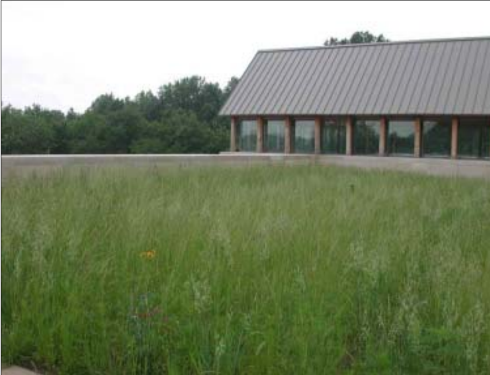
Evansville, Indiana - Vanderburgh Public Library