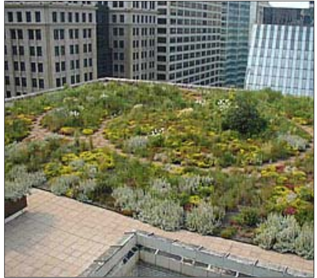
The green roof atop Chicago's City Hall

Green Roofs, also known as vegetated rooftops or eco-roofs, are essentially rooftop areas that have been installed with living vegetation. There are a variety of different types of green roofs, ranging from small gardens and planters to roofs that are completely covered by sod and plants. They have been used in Europe for decades and are growing in popularity in the U.S. and Canada. Lighter, thinner green roofs are known as extensive roofs, while the heavier more layered roofs are known as intensive. Green roofs can only be used on flat roofs or on roofs with gentle slopes (although some innovative techniques in Europe have grown turf on 45 degree angles). While weight is generally not an issue, as most green roof vegetation is actually lighter than a standard gravel and tar roof, consideration must still be given to soil selection and building structure to assure structural stability. The soil collects and holds rainwater and filters out contaminants, while plants soak up the water and provide evapotranspiration.