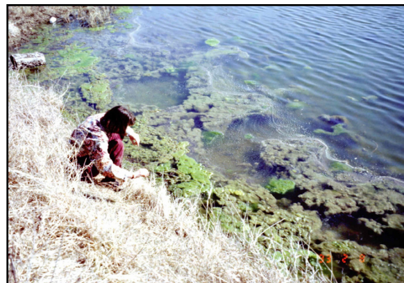
Figure 2. Excessive algae may look like moss, clumps or floating mats.