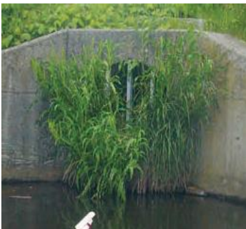
Over flourishing vegetation