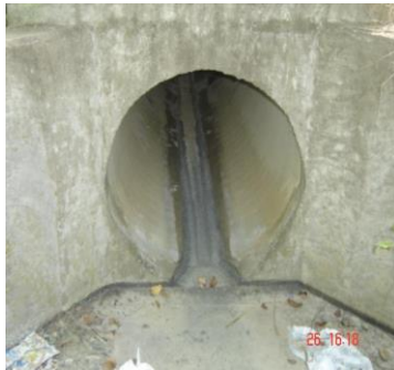
Grey-black stain (intermittent discharge)