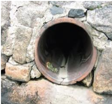
White stain (intermittent discharge)