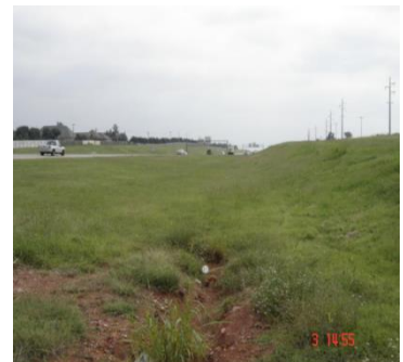
Normal vegetation (erosion)