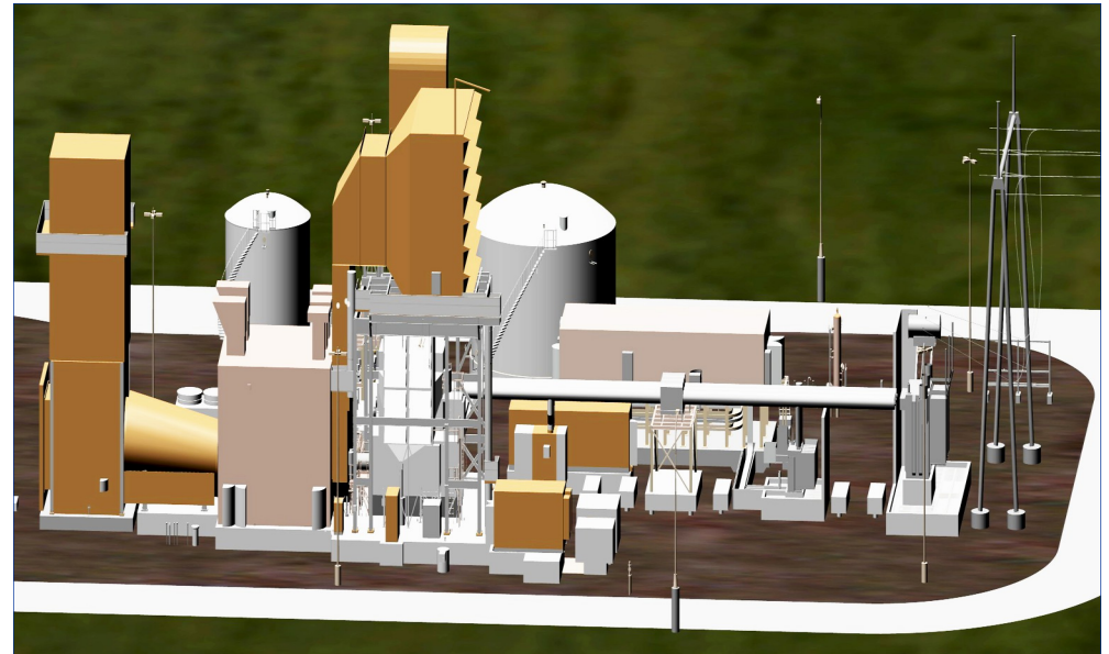
Rendering of the Charles D. Lamb Energy Center that is being built in northern Kay County, Oklahoma