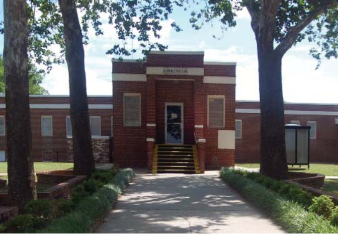
John Lilley Correctional Center Boley, Oklahoma