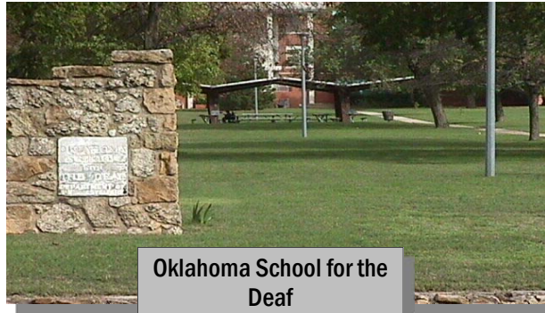
Oklahoma School for the Deaf Established 1898