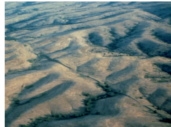
Trace of the Meers Fault as it cuts NW across the Slick Hills.

This is a great example of a Holocene (modern) geologic fault apparently tracing out the location of a much larger, older Pennsylvanian fault. During the Pennsylvanian uplift, the Meers Fault acted as a thrust lifting the area south of the fault 1 ½ miles higher than the Slick Hills side. However, about 1100 years ago, part of this fault moved up about 10–15 feet on the north side, creating a small scarp in the present topography and probably generating a large earthquake. For this reason, the Meers is famous to