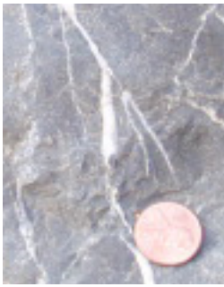
Limestone, with calcite veins. Penny shown for scale.

near Panther Creek; US 183 south of Roosevelt; Meers area.