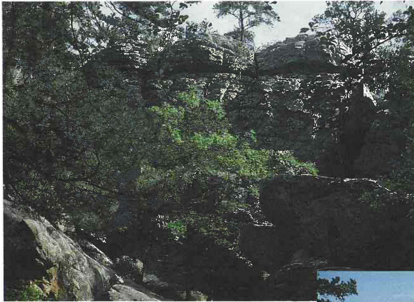
Figure 14 (above). Part of the high bluff at Robbers Cave, which is the erosion side of the cuesta formed in sandstone IPsv11 of the Savanna Formation.