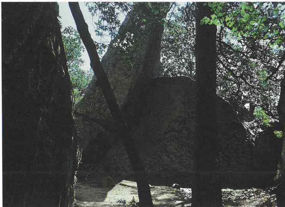
Figure 16 (left). Slumped blocks of sandstone result in an almost vertical cliff approximately the size of a three-story building along a joint in the bluff at Robbers Cave.